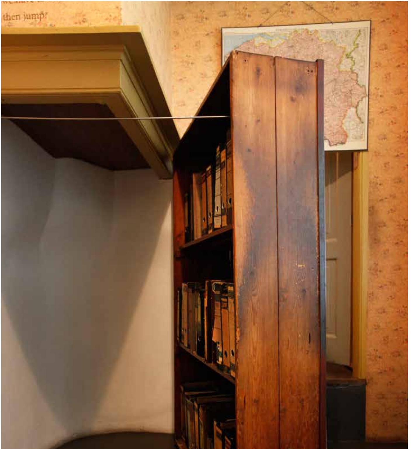
Moveable bookcase hiding the entrance to the Secret Annex.