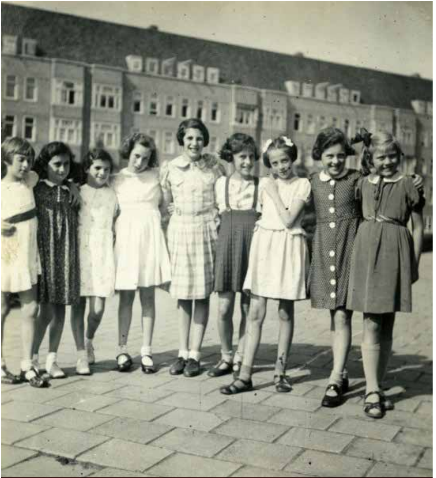
Anne Frank's 10th birthday party, June 12th 1939.